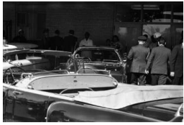
Title: Image of empty limousines outside Parkland Hospital Date: 11/22/1963 Primary Maker: Dallas Morning News Photographer Medium: Film Object number: 1994.003.0011.0001