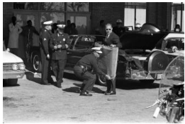
Title: Image of police officers at Parkland dealing with evidence from the limousine Date: 11/22/1963 Medium: Film Object number: 1994.003.0011.0006