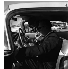
Title: Image of two men in a car outside Parkland Hospital using a radio telephone Date: 11/22/1963 Primary Maker: Dallas Morning News Photographer Medium: Film Object number: 1994.003.0014.0001