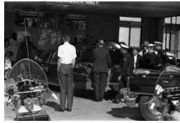
Title: Image of the cover being put on the presidential limousine at Parkland Hospital Date: 11/22/1963 Medium: Film Object number: 1994.003.0011.0004