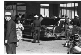
Title: Image of the cover being put on the presidential limousine at Parkland Hospital Date: 11/22/1963 Medium: Film Object number: 1994.003.0011.0005