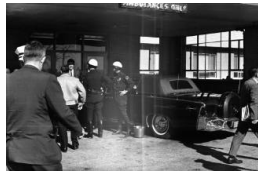
Title: Image of the presidential limousine with the top on at Parkland Hospital Date: 11/22/1963 Medium: Film Object number: 1994.003.0012.0001