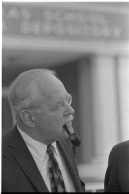
Title: Image of Warren Commission member Allen W. Dulles in Dealey Plaza Date: 1964 Medium: Film Object number: 2004.058.0399.0004