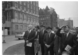
Title: Image of members of the Warren Commission looking at the assassin's window Date: 1964 Medium: Film Object number: 2004.058.0390.0004