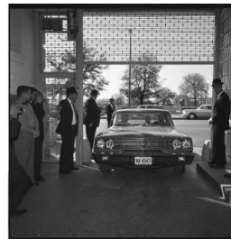
Title: Image of Dallas police officers driving Jack Ruby back to the jail building Date: circa 1964 Medium: Film Object number: 2004.058.0123.0002