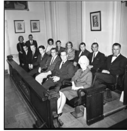
Title: Image of the jurors selected for the Jack Ruby trial Date: 1964 Medium: Film Object number: 2004.058.0339.0002