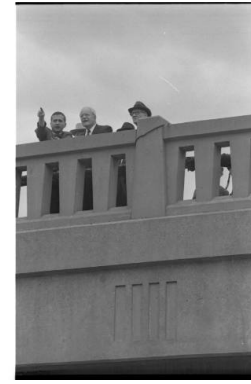
Title: Image of members of the Warren Commission standing above the triple underpass Date: 1964 Medium: Film Object number: 2004.058.0399.0001