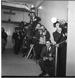
Title: Image of photographers and reporters in the courthouse for the Ruby trial Date: 02/21/1964 Medium: Film Object number: 2004.058.0184