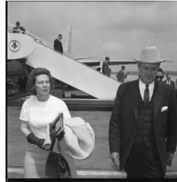
Title: Image of Texas Governor John Connally and his wife Nellie at Love Field Date: 04/22/1964 Medium: Film Object number: 2004.058.0055.0001