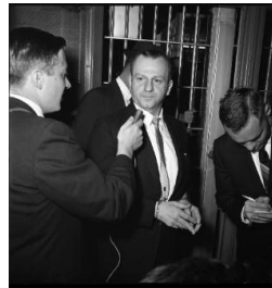
Title: Image of Jack Ruby in handcuffs escorted by police, answering questions Date: 12/23/1963 - 03/14/1964 Medium: Film Object number: 2004.058.0126.0001