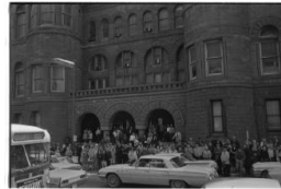
Title: Image of the crowd outside the courthouse during the Ruby trial Date: 02/21/1964 Medium: Film Object number: 2004.058.0201.0001