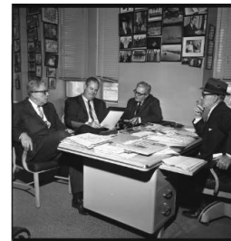
Title: Image of Judge Brown, Joe Tonahill, Melvin Belli and Sheriff Decker Date: 1964 Medium: Film Object number: 2004.058.0317.0001