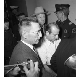
Title: Image of Jack Ruby in police custody Date: 11/24/1963 Medium: Film Object number: 2014.080.0289.0003