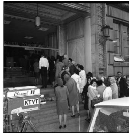
Title: Image of the crowd lined up on the courthouse steps to see the Jack Ruby trial Date: 02/21/1964 Medium: Film Object number: 2004.058.0187.0002