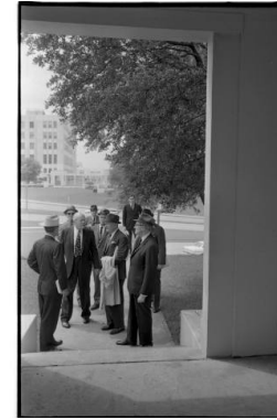
Title: Image of members of the Warren Commission near the grassy knoll Date: 1964 Medium: Film Object number: 2004.058.0394.0001