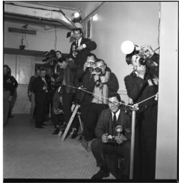
Title: Image of photographers and reporters in the courthouse for the Ruby trial Date: 02/21/1964 Medium: Film Object number: 2004.058.0184