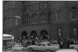
Title: Image of the crowd outside the courthouse during the Ruby trial Date: 02/21/1964 Medium: Film Object number: 2004.058.0201.0001