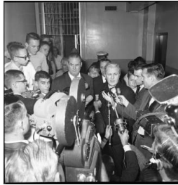
Title: Image of Ruby's lawyers Tonahill and Belli besieged by reporters Date: 03/14/1964 Medium: Film Object number: 2004.058.0359.0001