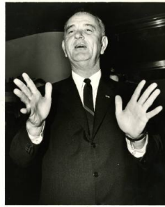
Title: Photograph of Lyndon B. Johnson Date: circa 1964 Medium: Paper Object number: 2004.058.0019