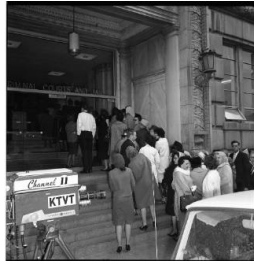
Title: Image of the crowd lined up on the courthouse steps to see the Jack Ruby trial Date: 02/21/1964 Medium: Film Object number: 2004.058.0187.0002