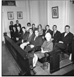
Title: Image of the jurors selected for the Jack Ruby trial Date: 1964 Medium: Film Object number: 2004.058.0339.0002