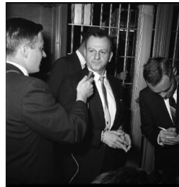
Title: Image of Jack Ruby in handcuffs escorted by police, answering questions Date: 12/23/1963 - 03/14/1964 Medium: Film Object number: 2004.058.0126.0001