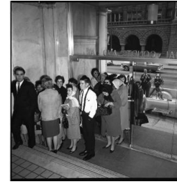
Title: Image of the crowd lining up to see the Jack Ruby trial Date: 02/21/1964 Medium: Film Object number: 2004.058.0190.0002