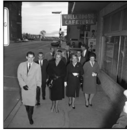
Title: Image of Ruby trial jurors going to dinner escorted by bailiffs Date: 02/26/1964 - 03/03/1964 Medium: Film Object number: 2004.058.0225.0001