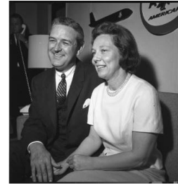
Title: Image of the Connallys' press conference at Love Field in 1964 Date: 04/22/1964 Medium: Film Object number: 2004.058.0057.0001