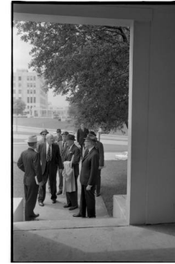
Title: Image of members of the Warren Commission near the grassy knoll Date: 1964 Medium: Film Object number: 2004.058.0394.0001