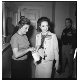
Title: Image of journalist Dorothy Kilgallen going through security at the Ruby trial Date: 1964 Medium: Film Object number: 2004.058.0077.0001