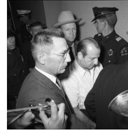
Title: Image of Jack Ruby in police custody Date: 11/24/1963 Medium: Film Object number: 2014.080.0289.0003