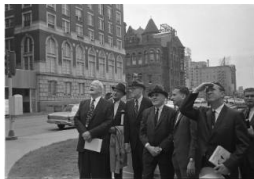
Title: Image of members of the Warren Commission looking at the assassin's window Date: 1964 Medium: Film Object number: 2004.058.0390.0004