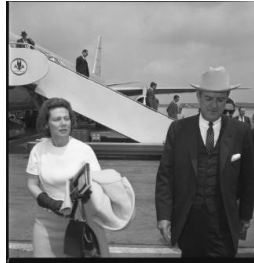
Title: Image of Texas Governor John Connally and his wife Nellie at Love Field Date: 04/22/1964 Medium: Film Object number: 2004.058.0055.0001