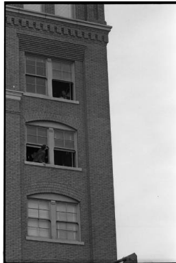
Title: Image of men in the fifth and sixth floor corner windows of the Book Depository Date: 1964 Medium: Film Object number: 2004.058.0396.0005