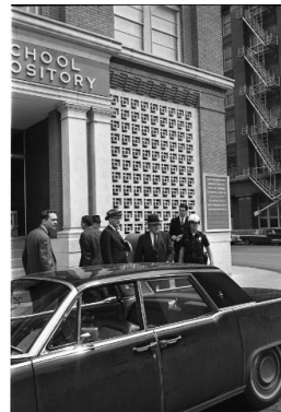
Title: Image of members of the Warren Commission in front of the Book Depository Date: 1964 Medium: Film Object number: 2004.058.0390.0002