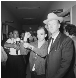
Title: Image of Lee Harvey Oswald in handcuffs at the Dallas police headquarters Date: 11/22/1963 Medium: Film Object number: 1994.003.0024.0002