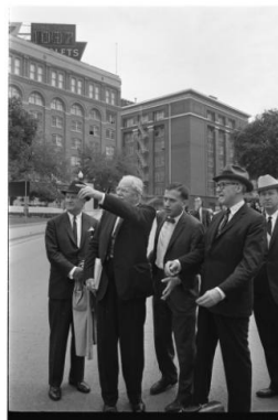
Title: Image of Warren Commission members and staff in Dealey Plaza Date: 1964 Medium: Film Object number: 2004.058.0393.0004