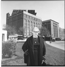
Title: Image of Oswald's mother Marguerite in front of the Texas School Book Depository Date: 1964 Primary Maker: Bill Winfrey Medium: Film Object number: 2004.058.0323.0002