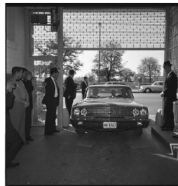
Title: Image of Dallas police officers driving Jack Ruby back to the jail building Date: circa 1964 Medium: Film Object number: 2004.058.0123.0002