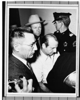
Title: Image of Jack Ruby being escorted through the courthouse hallway Date: 1964 Medium: Film Object number: 2004.058.0049